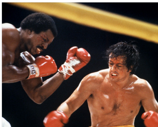
The D's NCC vs Palmerston clash was an absolute last man standing affair!