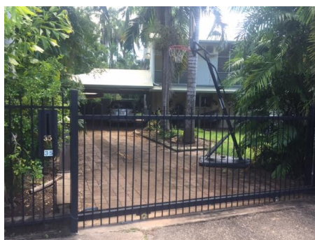
35 Waters Street, Rapid Creek. Saw more ‘runs’ than a home brand stocking in its day!